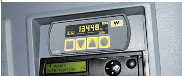
M350S in-cab indicator, radio, dash, panel mount or hand held